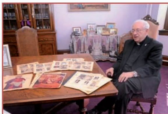
Villa Sacred Heart

display with photos of both popes at the left of the main altar in his parish, Our Lady of Mount Carmel Church. It was displayed through the evening of the canonization.